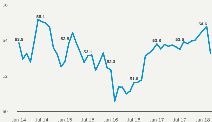
Global PMI: Composite Output

the impact of the nearly $800 billion tax and spending package passed last December. Many investors have worried that should companies choose more capital spending or investment now, then their stock prices would come under pressure near term. If the US economy proved unable to accelerate, substantial future debt issues likely loom—and the US Dollar would weaken, perhaps considerably, over time. By our lights, this is a big “if,” but it likely